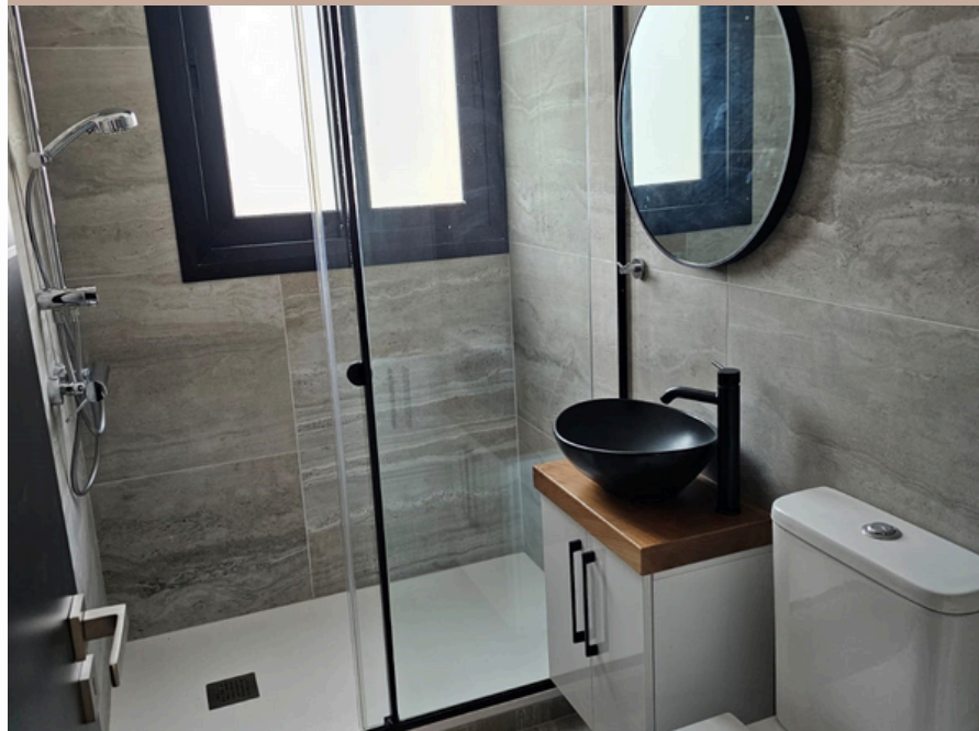
Floor and walls Granite porcelain Grohe Mixers