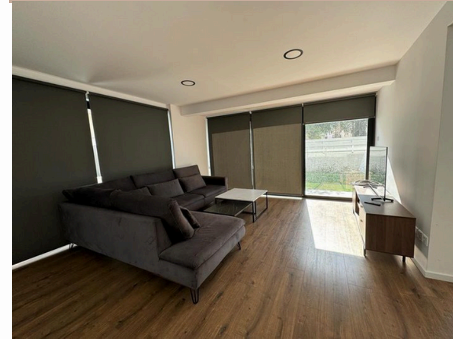
Ceramics topped with German high quality parquet.