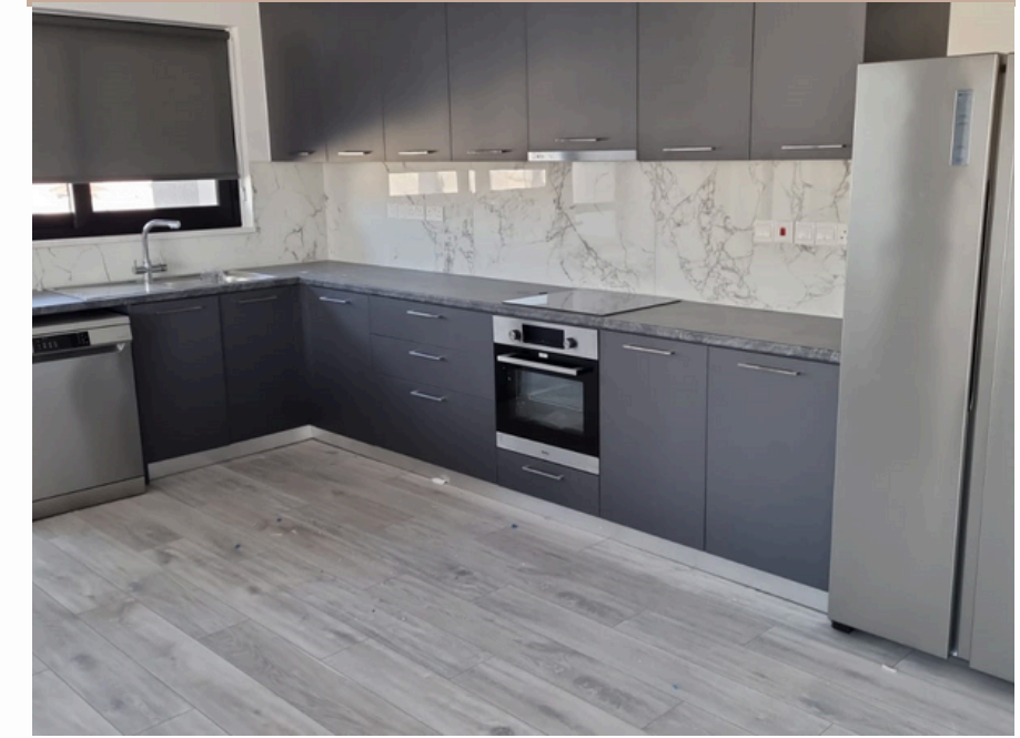
Modern Kitchen design, electrical appliances AEG, Samsung or similar.