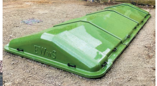
Packaged Plant Installed