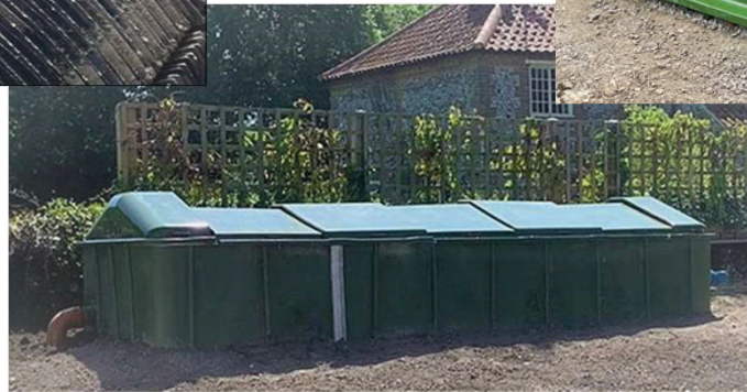
Unit serving a P.H. in Norfolk

The plant includes a robust GRP tank which includes the Primary Settlement Tank, RBC with integrated forward & internal recirculation flow management systems and Final Settlement stage. The RBC is covered with light, lockable GRP sectional covers. Sludge collected in the PST can be removed using a suction tanker lorry. Suitable for a safe one-person operation. The final settlement tank has a sludge return pump system which returns fine sludge to the PST on a timer operation.