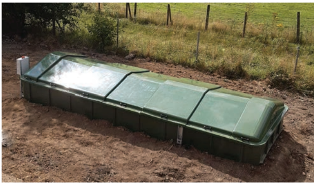
RBC Unit Packaged Plant

His process knowledge as a chemical engineer coupled with his experience in the wastewater treatment field has resulted in a unique compact plant product which offers both flexibility for specific process requirements with RBC structure designed for life in excess of 30 years, that meets the industry standards and offers a 20-year warranty for its key components: casing, covers, shaft and media.