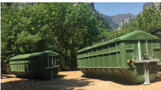
2 Units in Northern Spain

EWwS offer process optimisation for every plant after it has been installed.