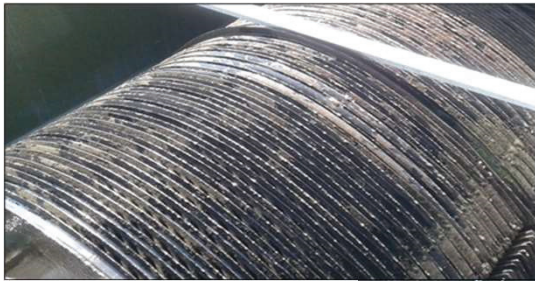
RBC Rotating Media

EWwS Ltd is better known for its larger diameter RBCs for municipal and industrial wastewater treatment plants. EWwS are a technically innovative company and have applied their know how to small packaged plants for commercial applications such as housing complexes, nursing homes, hotels, leisure industry and locations not connected to mains drainage. These packaged plants in GRP are easily transported by truck and can be shipped in an ISO container. The plant can be offloaded on to a concrete slab, backfilled, connected to inlet/outlet drains, wired up and commissioned.