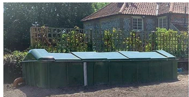
Unit serving a P.H. in Norfolk